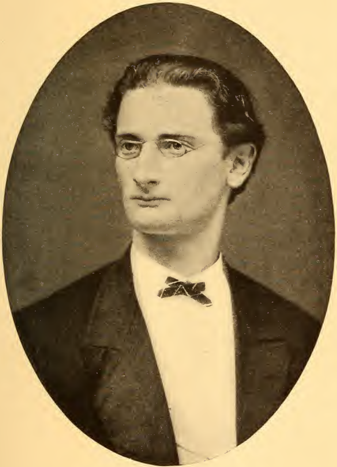
JOSEPH PULITZER AT THE AGE OF TWENTY-THREE